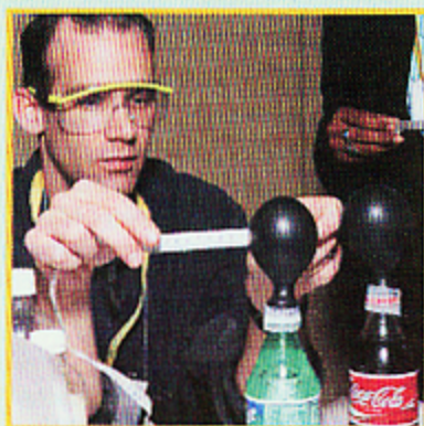
Participant engaged in chemical experiment